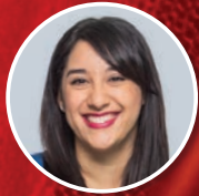
VIRY MARTINO TURNER CONSTRUCTION COMPANY