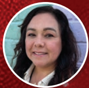
DIANE PROSPERO CHILDREN'S PARADISE PRESCHOOL & INFANT CENTERS