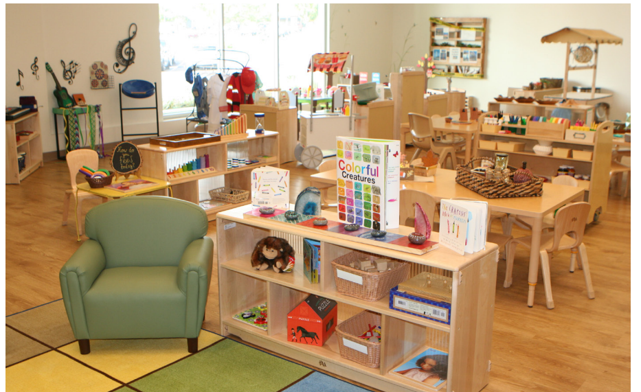
The new Children's Paradise will offer fresh learning tools, activity centers, and age-appropriate developmental toys every few weeks to keep the classrooms dynamic and inspiring.