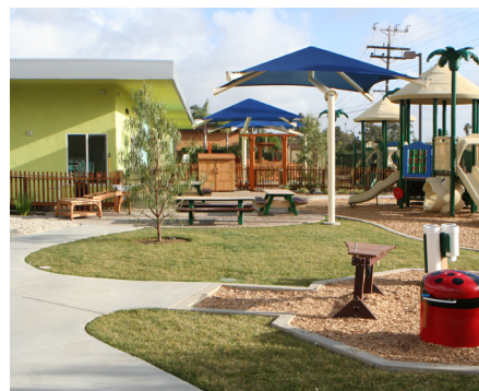
Outdoor play areas are expansive, filled with equipment that encourages physical activity and motor skills development.