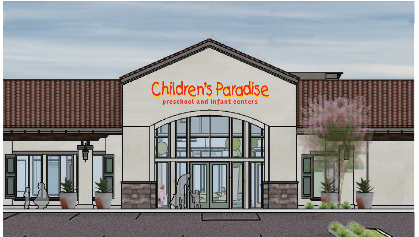
Children's Paradise Preschool & Infant Centers will open in Carlsbad in early 2025. Wait List forming now with priority given based on need and registration date. For more information or to join the waitlist, please call 800-650-CARE or visit childrensparadise.com .

The Carlsbad center is committed to hiring the most highly qualified teachers to nurture and support children. These teachers will receive ongoing support from a corporate education team and will be provided with fresh learning tools, activity centers, and developmental toys every few weeks to keep the classrooms dynamic and inspiring. With low teacher-to-student ratios, each child will receive individualized attention and care. Teachers will work in partnership with parents using developmental evaluation tools and meeting regularly to ensure that everyone involved in the child's journey is engaged. Additional support, including